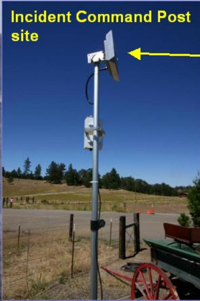
Incident Command Post site