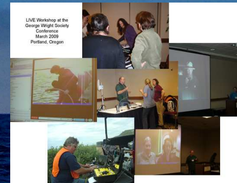
George Wright Society