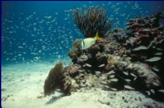
Bio Blitz Biscayne National Park April 30-May 1, 2010