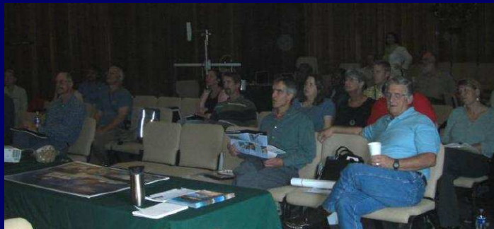
National Association for Interpretation – Nov. 2009