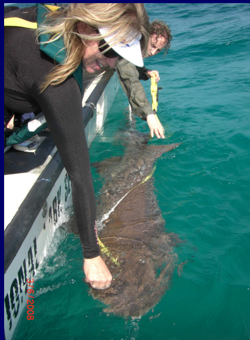
LIVE shark Tagging from CA and FL