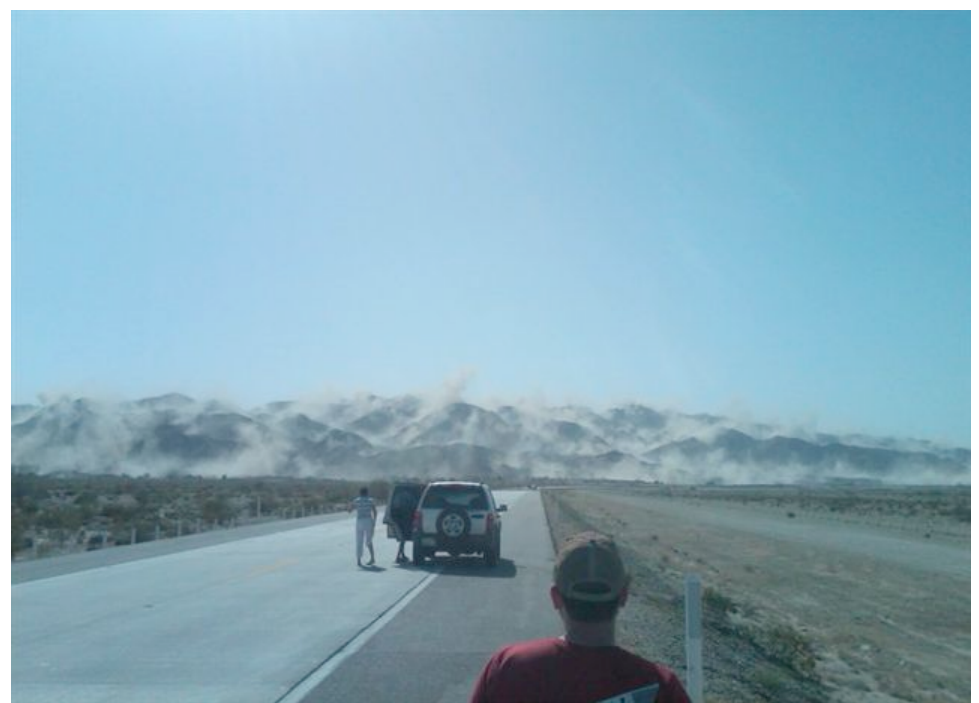
Figure 3. Photo of the mountain chain along the rupture. Dust was kicked up by the ground shaking in the mountains. The Earth's surface acts as a speaker. The mountains or nearby valleys radiated the infrasound that traveled to southern California infrasound arrays MRIAR and I57US.

In summary, the infrasound signals observed at MRIAR and I57US in southern California are consistent with the strong ground shaking that is expected in the vicinity of the Mw 7.2 rupture (Figure 1). Specifically, the signal back azimuths at I57US span the rupture within the uncertainties of the data. At MRIAR, the signal back azimuths and elevation angles are better constrained and suggest a spatially extended remote source. The intersections of back azimuth projections from MRIAR and I57US span the Mw 7.2 rupture, the location of which is inferred from seismic and surface rupture mapping data. Figure 3 shows a photo taken right after the earthquake of a mountain range (likely along the Borrego fault) that was "dusted" by shaking associated with the rupture. It is no surprise that ground shaking also creates infrasound. With the recent advances in (1) infrasound wind filters that improve infrasound data quality and (2) near-real time atmospheric velocity models that improve our ability to predict infrasound amplitudes and ray paths, infrasound arrays in seismically active areas, perhaps sharing infrastructure with existing seismic stations, may provide an independent, but relatively direct measure of the relative intensity of surface shaking for large M > 7 earthquakes and assist hazard response efforts.